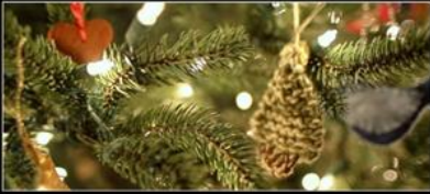
Christmas Morning in St. Brigid's Kilbride Family Service at 10am

A short celebration of the Holy Eucharist for Christmas Eve. St. Patrick's Church, Powerscourt 9pm.