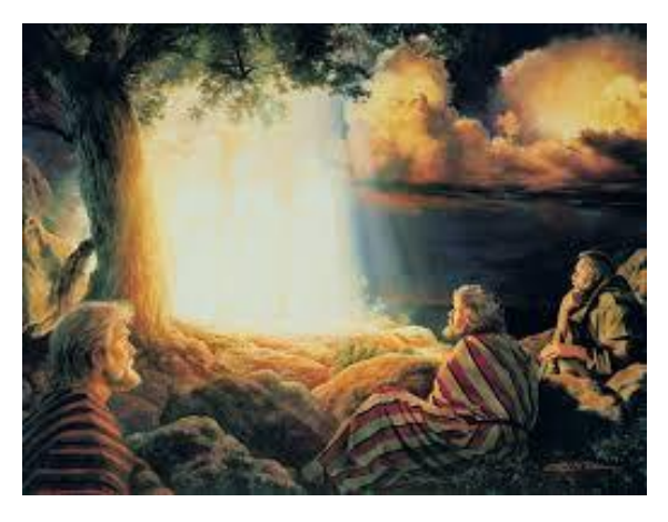
9 As they were coming down the mountain, he ordered them to tell no one about what they had seen, until after the Son of Man had risen from the dead.

Jesus chose to take just three close friends with him and led them on an upward climb to a new level of understanding – a higher ground, both physically and metaphorically. The true essence of the Christ is revealed to those who are prepared to follow, even in rough terraine!